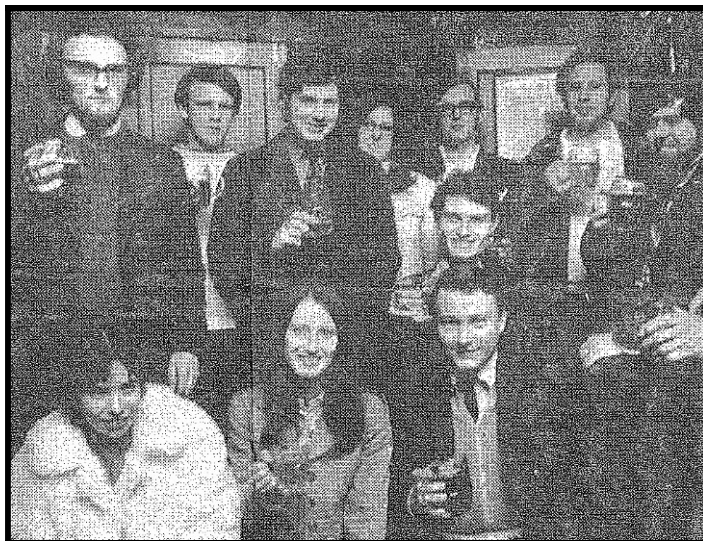
A welcome pint after four peals of Cambridge in a day (1973).

Amongst his tower bells achievements were to take part in 4 peals of Cambridge in a day in St. Albans, and 5 peals at Loughborough in a day.