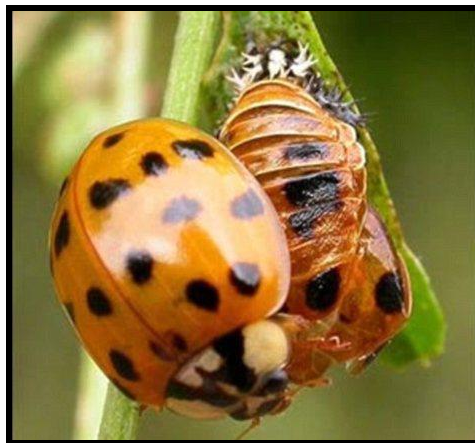
The Harlequin attending to its pupa