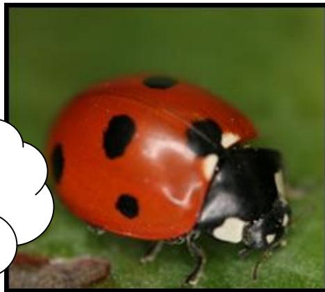
7- spot Ladybird