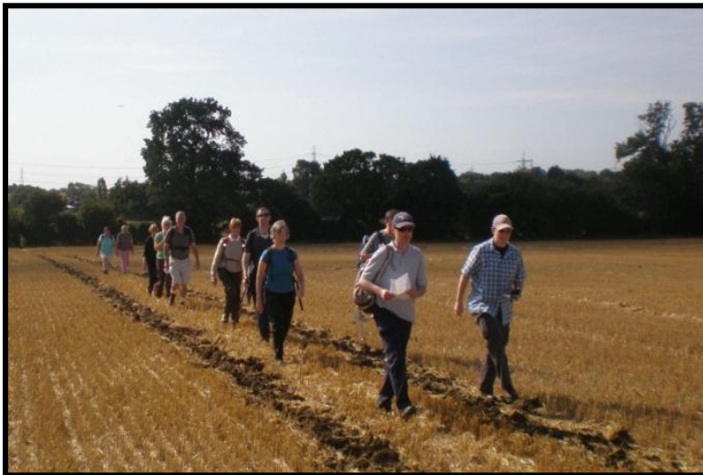
On the way to Great Wymondley