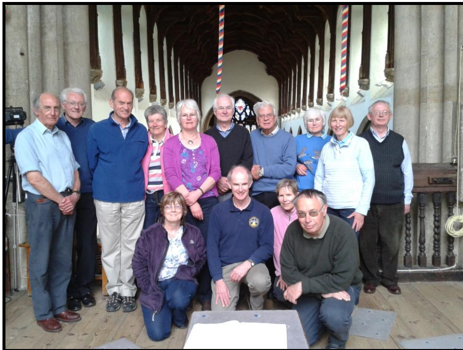
Swaffham: Photo by Chris Hunt

Fully refreshed, we met again to ring at the 15 cwt eight at Swaffham. A balcony ring with a good view of the most impressive carved wooden ceiling in the aisle. A very long draught (probably >60 feet) but aided by two separate rope guides so these bells were not too difficult to handle. We rang a variety of methods including some good Stedman Triples.