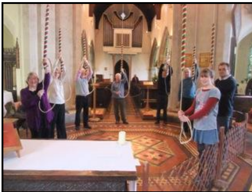
The Wheathampstead Ringers

Adventurous ringers with a sense of humour are always welcome on Mondays at 8pm!