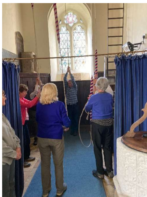
Ringling at Rushden

At Rushden, there was a Vegan/Vintage Day in the village and the locals made us very welcome and many enjoyed a very good vegan curry for lunch.