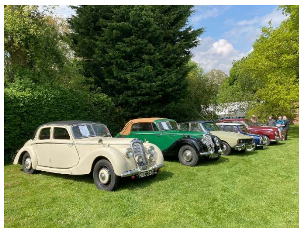
Vintage cars on display at Rushden Fete.