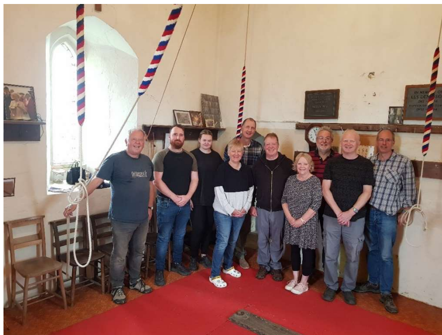
Ringers at St Paul's Walden.