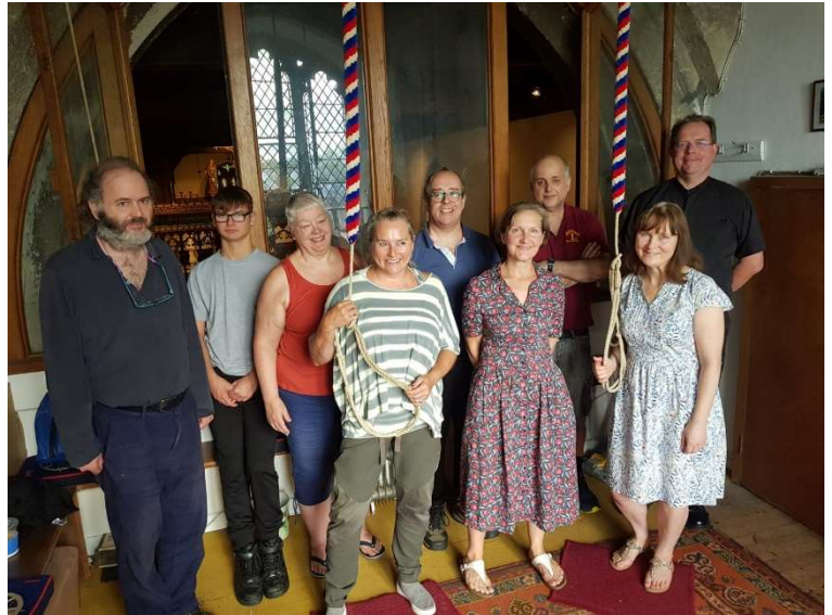
South Mymms Ringers (Sat 10 th )