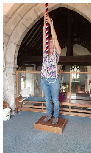
Ringling the tenor at Ridge