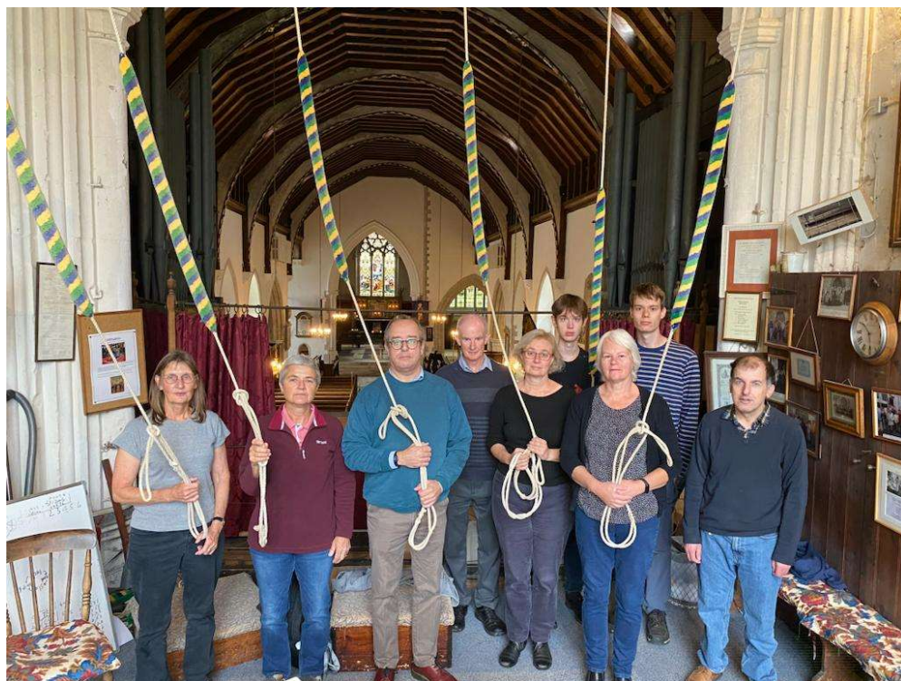
The ringers at Hatfield on Monday 19 th .