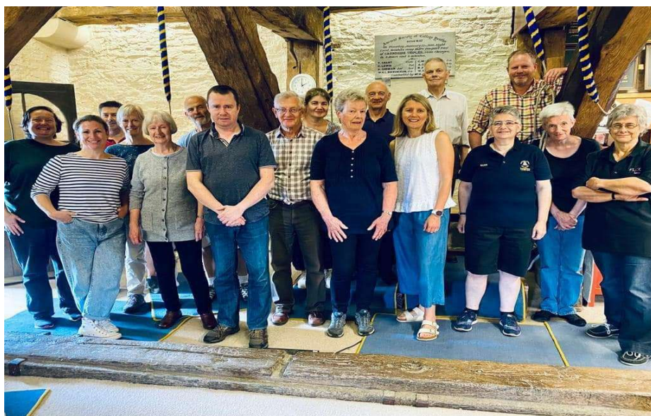
The Abbey Ringers

On Monday 19 th : General Ringing (half muffled) including Rounds on ten followed by slow tolling on the tenor prior to the funeral of HM Queen Elizabeth II.