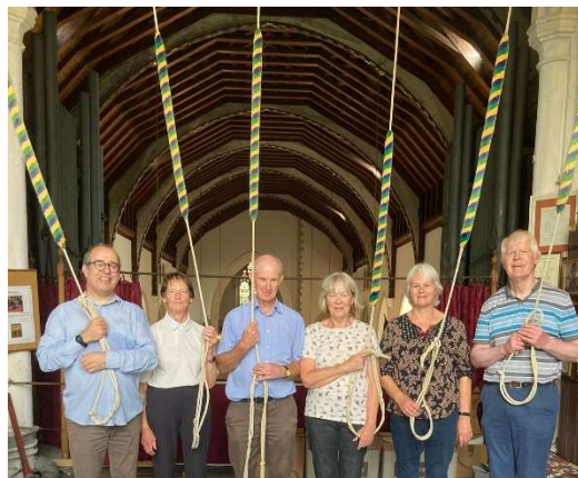
Hatfield Ringers on Friday 9th

Rung prior to the State Funeral of HM Queen Elizabeth II